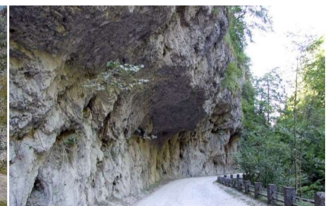
Keys of Olteț

The Transalpina or "King of the Road" is the highest road in the country, stretching over a road of 137 km. Transalpina starts from Gorj (the town of Novaci), and then passes through the counties of Vâlcea and Sibiu until it reaches Alba (the town of Sebeș).