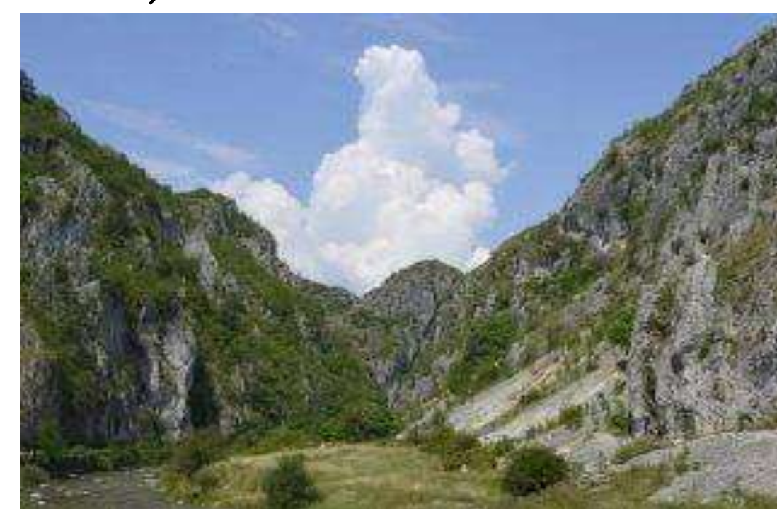
Keys of Sohodol

• The Olteț Keys are part of a nature reserve in Gorj County, one of the most beautiful tourist attractions in the area, and have extraordinary landscapes to show, with waterfalls, bare rocks, caves dug into the top of the mountain and meadows surrounded by various types of trees, from deciduous to conifers.